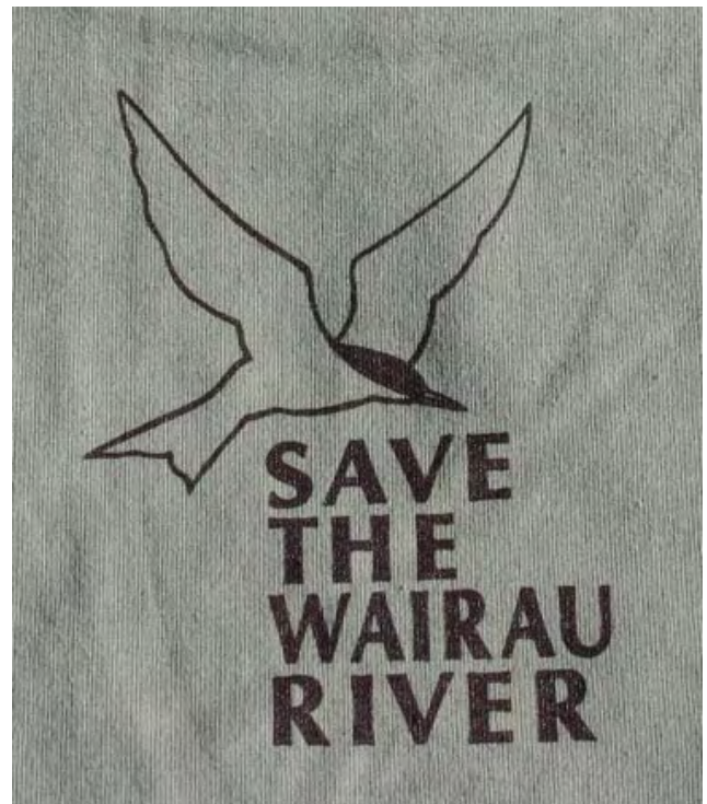
Logo on back of all polo shirts and t-shirts